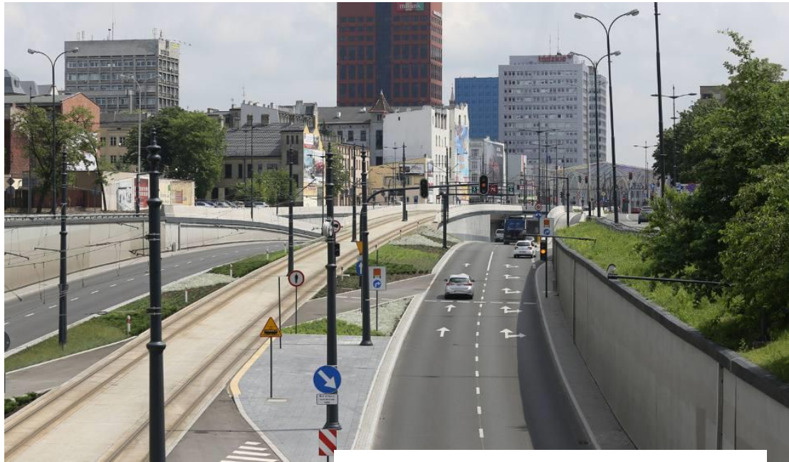
The Lodz city tunnel (Poland) is fundamental for transport travelling across a city of 700,000 inhabitants.

The Lodz City Council's core mission is to manage the important infrastructure by assigning work and surveying its implementation according to the terms of the project and under the jurisdiction of the law. The Lodz City Council is an organizational unit of the city of Lodz, whose main objective is to provide assistance to the city's Mayor, in order to ensure that provisions are properly implemented and that all the tasks and objectives undertaken by the city are carried out in accordance with the law.