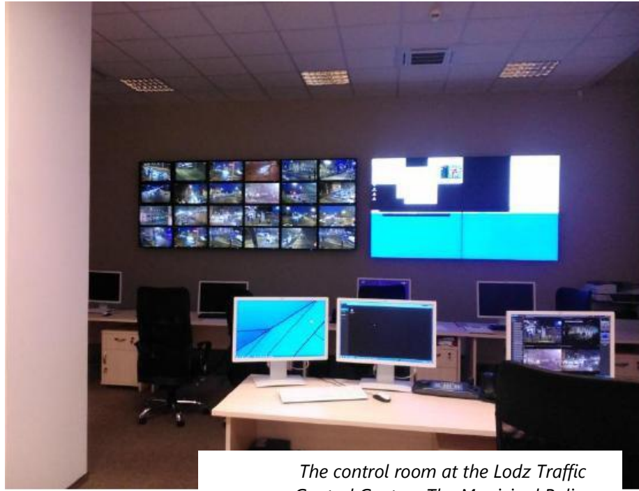
The control room at the Lodz Traffic Control Centre. The Municipal Police offices are also connected to the system.

The project completed with satisfactory results by fully complying to the client's demands both in terms of safety and efficiency. Thanks to the automatic controller logic, automatic traffic deviation control scenarios can be easily activated in real-time to provide road users with information by means of using VMS panels and Lane Control Signs to reduce the risk of serious accidents and traffic congestion.